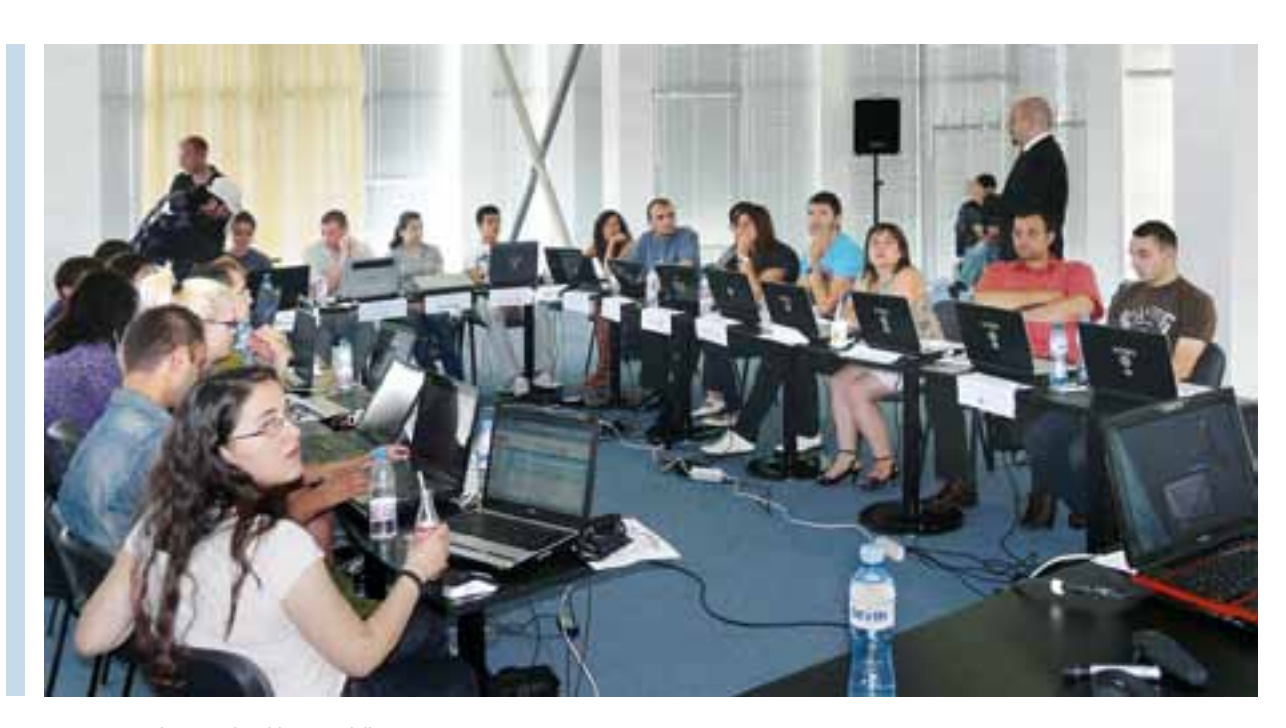
Participants enhancing their blogging skills

A second workshop on the same topic was held in Bankya, Bulgaria.