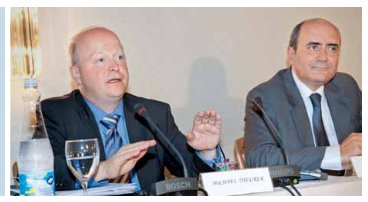
MEP Michael Theurer and Emmanouil Manoledakis

In conclusion, it was agreed upon that the Greek system as it is organised today cannot meet the needs of its communities and citizens. Considerable autonomy is needed and this can be achieved by giving greater resources to regional and local authorities so they are able to serve their constituents more effectively.